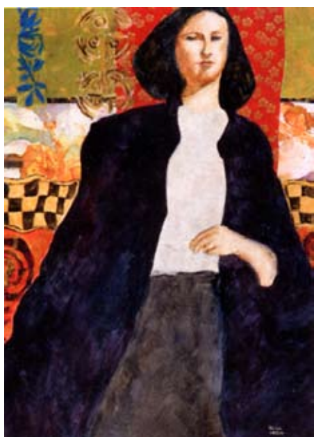
What She Missed (watermedia and collage on paper, 22.5x16.5) by Rosa Vera BALTIMORE WATERCOLOR SOCIETY