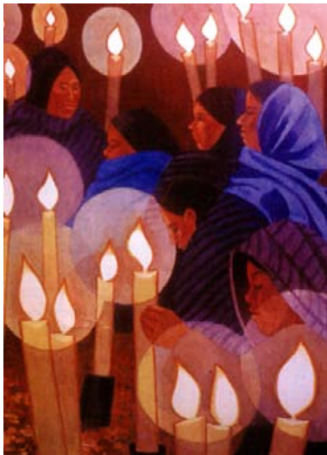
Night of 1,000 Candles (watercolor on paper, 30x22) by Joanna Mersereau WATERCOLOR WEST