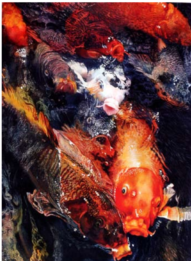
Feeding Time (watercolor on paper, 30x22) by Soon Y Warren NATIONAL WATERCOLOR SOCIETY