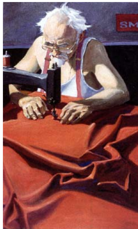
Nightwork III (watercolor on paper, 40x30) by Tim Gaydos THE ARTS GUILD OF OLD FORGE