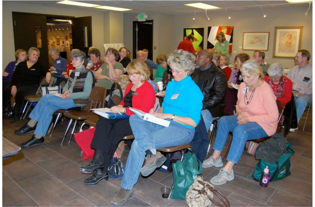
PPWS Meeting - December 16, 2009