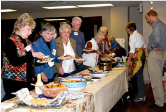
Tonight's meal got rave reviews!