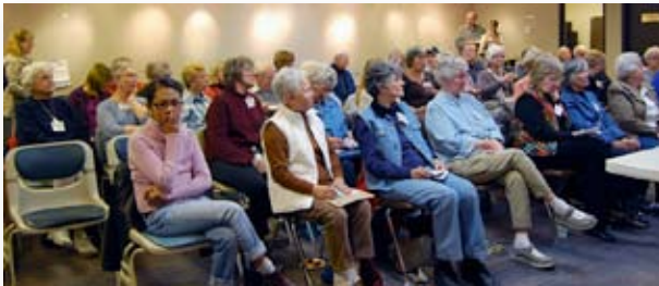
A very well attended meeting...