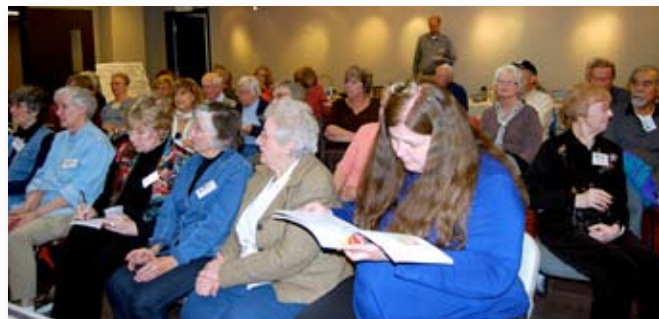
...after which we viewed all of the 494 entries into Watermedia.